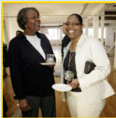
Community members celebrate the groundbreaking of the Center.